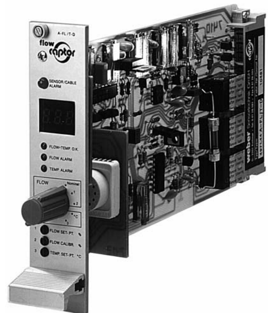
flow-captor eurocard for 19" rack mounting

Typical applications are found wherever cooling and lubrication systems require accurate and reliable measurement, e.g. oven cooling systems in the steel industry, in raw material productions or in power stations.